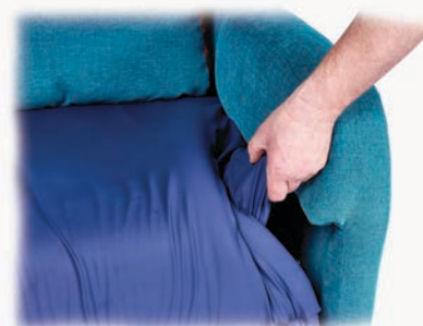
Removable Pressure Relief Grade 1-2 as standard