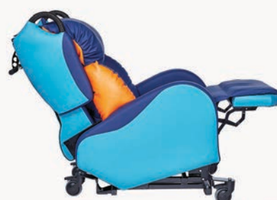
True Tilt-in-Space & Leg-Rest