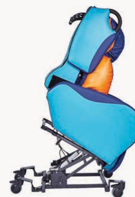
Lift to Stand