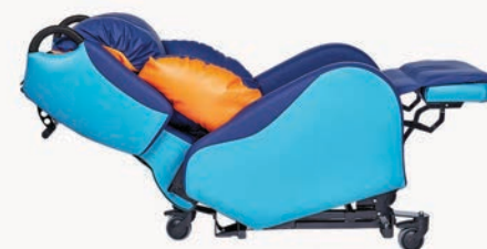
Tilt-in-Space & Leg-Rest & Backrest